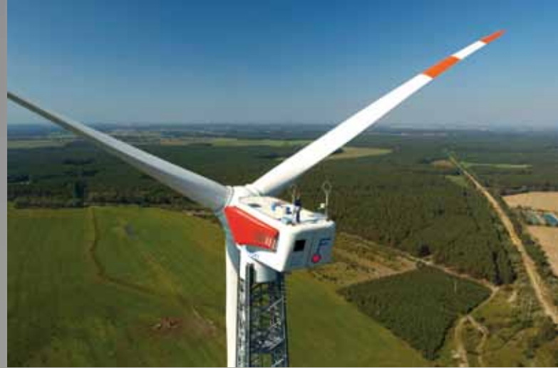
World record: 160 meter hub height